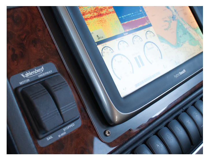
The M-485-A sound signal timer at Tallulah's lower helm

Tallulah had a locker space on the flybridge that was not utilised in day-to-day cruising and that made for a convenient location for the air compressor set. Once the tank is charged the compressor runs only when the horns are sounded and hence motor noise is not a factor although it is equally possible to mount the compressor and reservoir a further distance away in the engineroom without loss of efficiency.